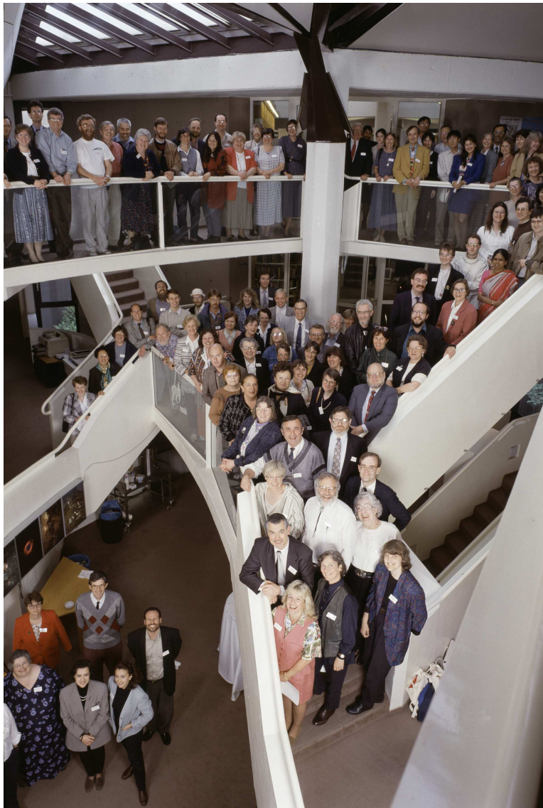
Figure 3. LISA II group photo.