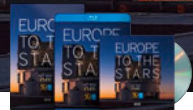
How Europe went south to observe the Universe

ESO'S FIRST 50 YEARS OF EXPLORING THE SOUTHERN SKY