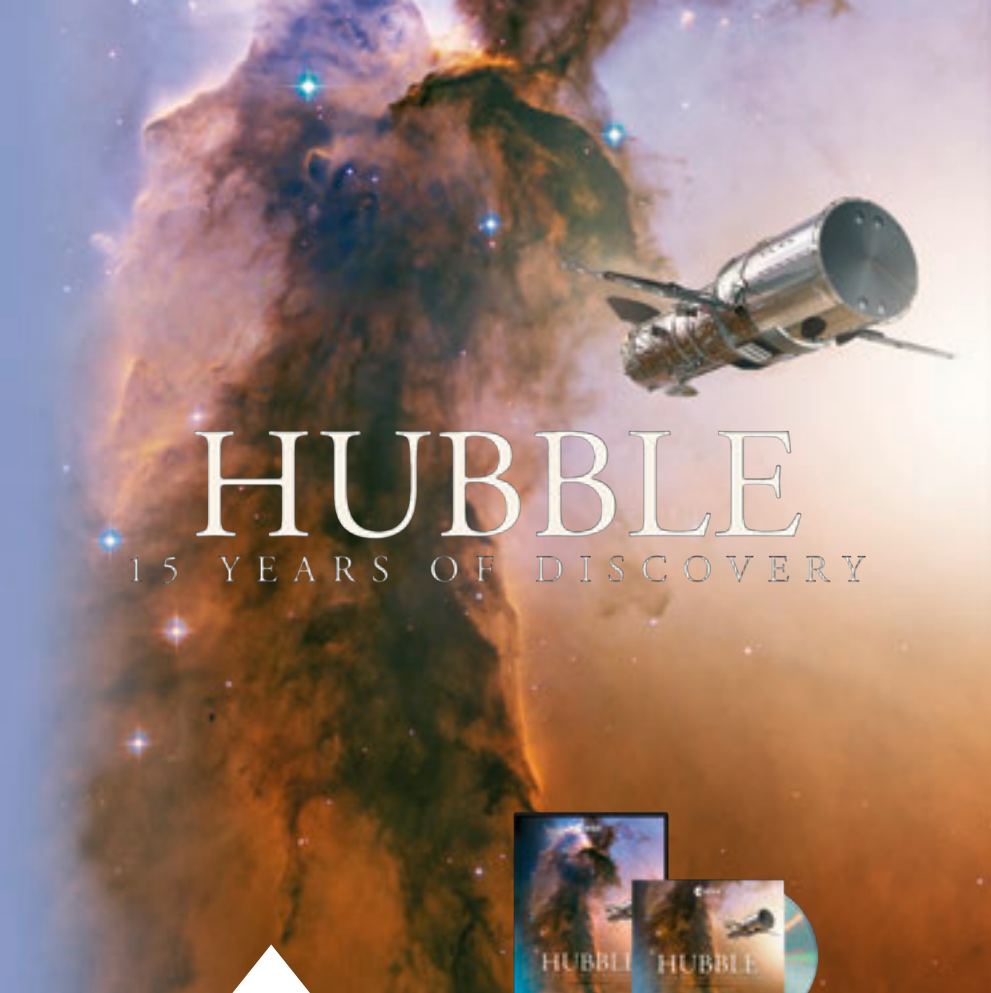
A journey through the story of Hubble