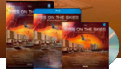
400 years of telescopic discoveries