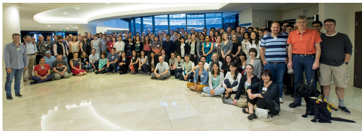
Figure 1. Conference photo.

The workshop webpage 4 has many more details, including more information