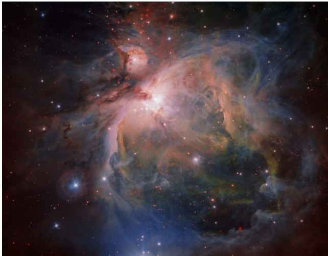
Figure 1: True colour image of the Orion Nebula Cluster obtained using OmegaCAM data.

Figure 1 shows a true-colour image of the Orion Nebula Cluster (ONC) obtained using OmegaCAM data which are part of this release, with a 59.95 \times 46.56 -arcminute field of view. In the left panel of Figure 2 we instead show the colour-magnitude diagram (CMD) of the entire stellar population sampled with the ADHOC data within a radius of 1.5 deg around the ONC while in the right panel of the same figure we show the stellar population selected at the distance of the ONC ( \sim 400 pc) using GAIA Dr3 parallaxes. The ONC stellar population is identified with unprecedented accuracy. The CMDs clearly show the photometric accuracy that can be achieved with the ADHOC data.