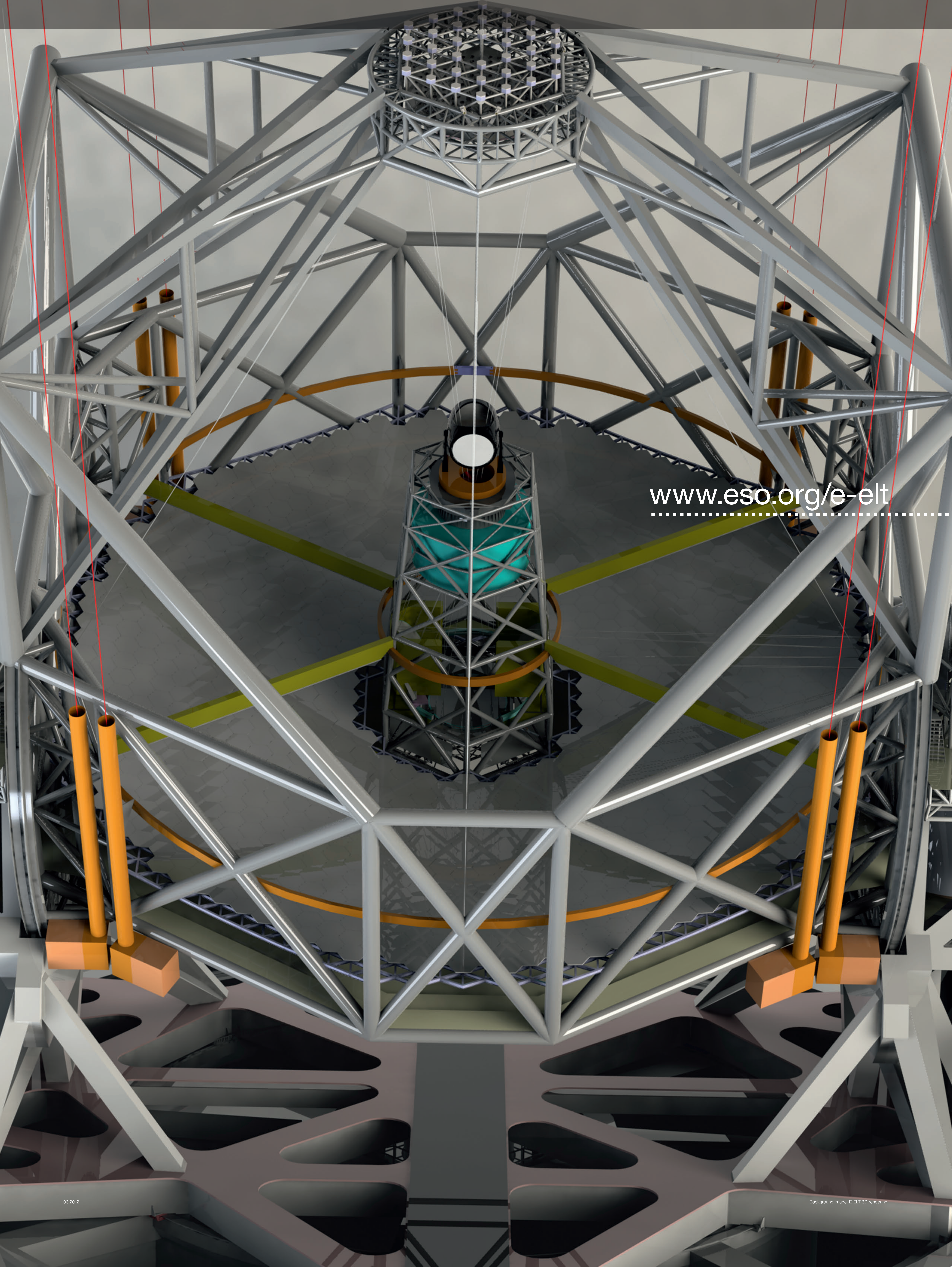
Close-up view of the E-ELT in its enclosure showing the novel five-mirror approach (artist's impression).